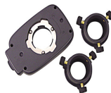
Microscope Adapter & Coupler